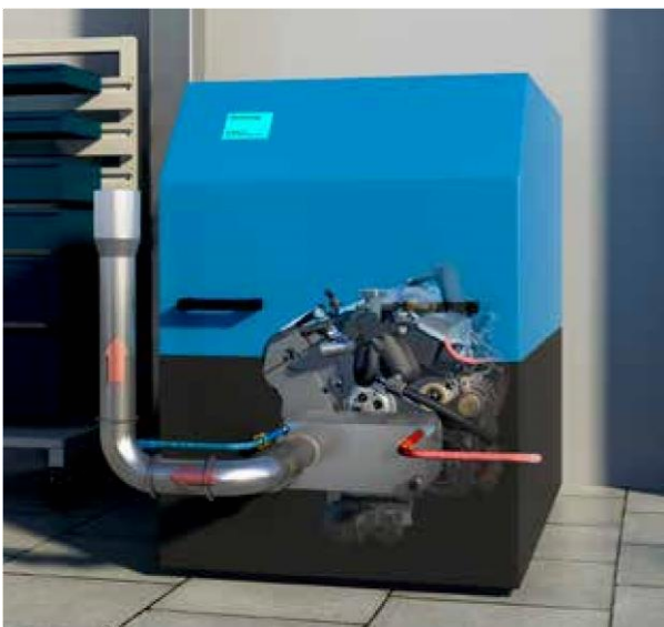
Combined heat and power

When used in heat recovery, Alfa Laval heat exchangers provide a fast ROI as well as huge environmental benefits. For low-pressure applications the combination of high performance with low pressure drop often offers payback within one year